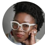
Joy Buolamwini, Ph.D.

Molecular biologist, Nobel Laureate in Physiology or Medicine, UCSF Prof. Emerita of Biochemistry and Biophysics, former Salk Institute Pres.