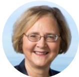
Elizabeth Blackburn, Ph.D. Co-Chair

Molecular biologist, Nobel Laureate in Physiology or Medicine, UCSF Prof. Emerita of Biochemistry and Biophysics, former Salk Institute Pres.