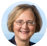
Elizabeth Blackburn, Ph.D. Co-Chair

Molecular biologist, Nobel Laureate in Physiology or Medicine, UCSF Prof. Emerita of Biochemistry and Biophysics, former Salk Institute Pres.